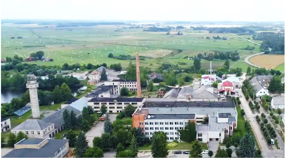
Overview of the facilities from the top

Juodupė town fosters traditions in light industrial manufacturing processes since year 1907, when wool textile processing factory was established. Textile industry at Juodupė had employed over 1000 people back in its days of prosperity and products were shipped all over Europe and over the Atlantic.